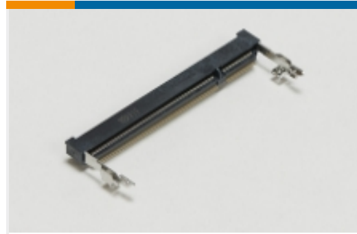
SO DIMM Sockets(12)